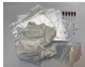
JRS-2300001 – Packaging Kit – 25€

Order your Jet Repair Packaging Kit now to avoid your printhead arriving to us like the below examples. Improper packaging of the printheads causes them to dry and clog even more. It doesn't need much explaining that this slows down the cleaning process.