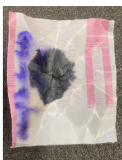
Contaminated Nozzle Test