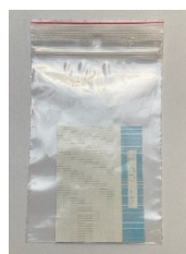
Proper packed Nozzle Test