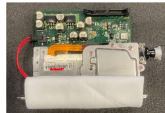
Fold the wipe around the printhead