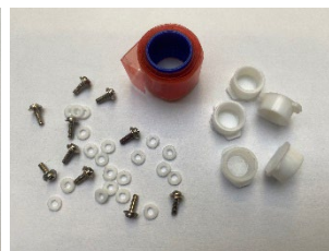
Printhead Survival Kit