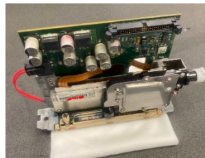
Place the printhead onto the wipe