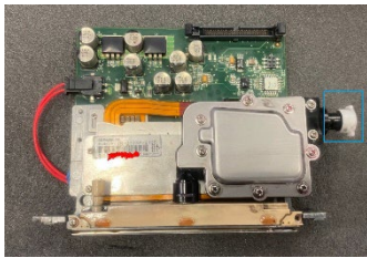
With damper : Use the Damper Cap