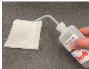
Moisten a wipe with UV Flush