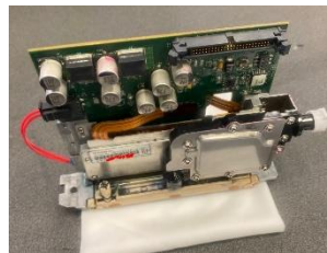
Place the printhead onto the wipe