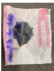
Contaminated Nozzle Test