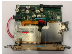
Without damper : Use a Damper Replacement Kit