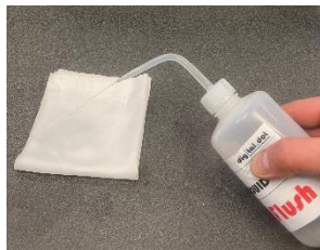
Moisten a wipe with UV Flush