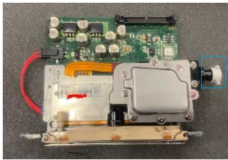
With damper : Use the Damper Cap