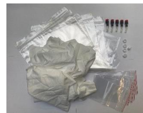
JRS-2300001 – Packaging Kit – 25€

Order your Jet Repair Packaging Kit now to avoid your printhead arriving to us like the below examples. Improper packaging of the printheads causes them to dry and clog even more. It doesn't need much explaining that this slows down the cleaning process.