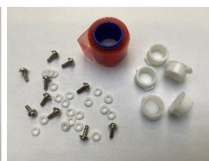
Printhead Survival Kit