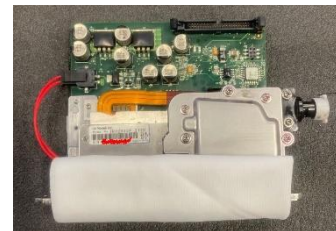
Fold the wipe around the printhead