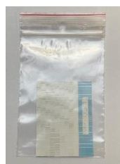
Proper packed Nozzle Test