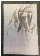
Contaminated Nozzle Test