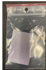
Proper packed Nozzle Test