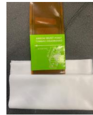
Fold the wipe around the printhead