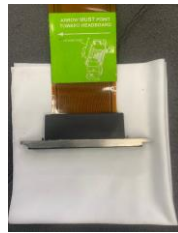
Place the printhead onto the wipe