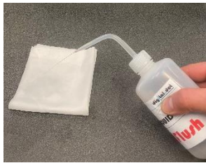
Moisten a wipe with UV Flush