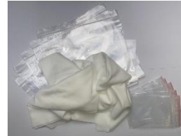
JRS-1100002 – Packaging Kit – 15€

Order your Jet Repair Packaging Kit now to avoid your printhead arriving to us like the below examples. Improper packaging of the printheads causes them to dry and clog even more. It doesn't need much explaining that this slows down the cleaning process.