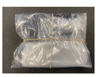
Seal the printhead with shrink wrap or place it inside a plastic bag

5. Do NOT include the nozzle test in the above shrink wrap, as it can be contaminated by Flush or ink. Place it separately in a small plastic bag.